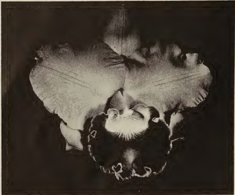
LC. GITCHE MANITO ( LC. Morvyth var. Magnifica x C. Gay Gordon )